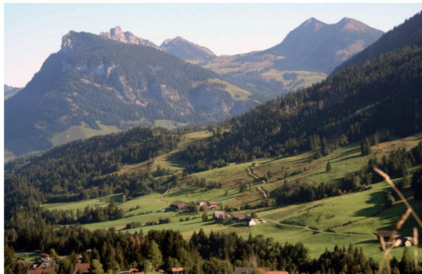
Landscape section Hagleren of the national protected moorland landscape Glaubenberg in UNESCO Biosphere Reserve Entlebuch (UBE): the moorland areas are the major landscape feature of the UBE and at the same time a cultural landscape of diverse structures. Its ecological values emerged through gentle forms of land use and forestry

The non-material significance of moorland landscapes is related to mental well-being: they serve as sources of inspiration and knowledge and also play an important emotional and aesthetic role.